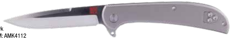
Hawk ITEM: AMK4112