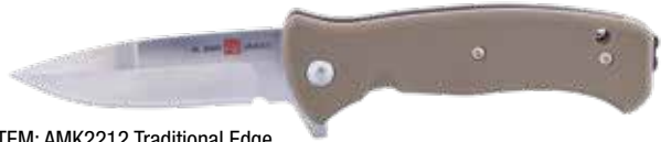
ITEM: AMK2212 Traditional Edge

Among the strongest tactical folders in existence