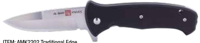
ITEM: AMK2202 Traditional Edge