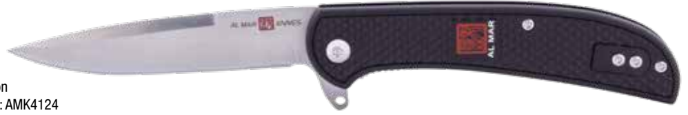
Falcon ITEM: AMK4124