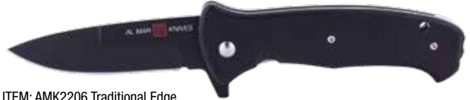
ITEM: AMK2206 Traditional Edge