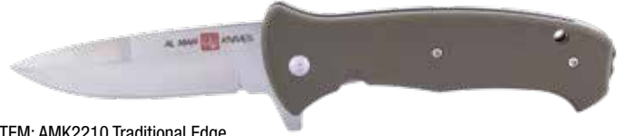
ITEM: AMK2210 Traditional Edge