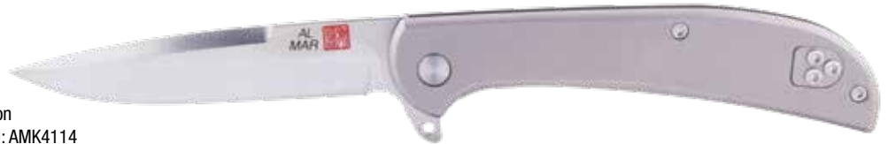
Falcon ITEM: AMK4114