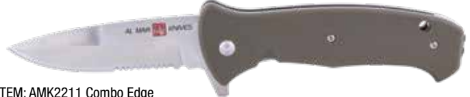
ITEM: AMK2211 Combo Edge