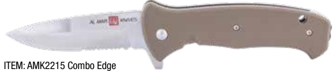
ITEM: AMK2215 Combo Edge