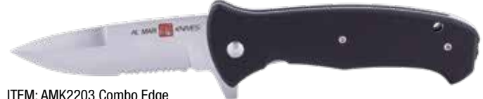
ITEM: AMK2203 Combo Edge