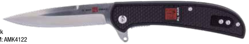
Hawk ITEM: AMK4122