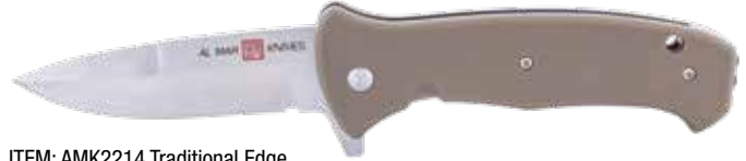
ITEM: AMK2214 Traditional Edge