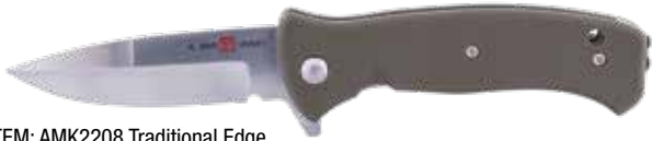
ITEM: AMK2208 Traditional Edge

Among the strongest tactical folders in existence