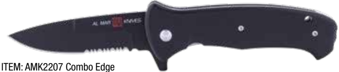
ITEM: AMK2207 Combo Edge